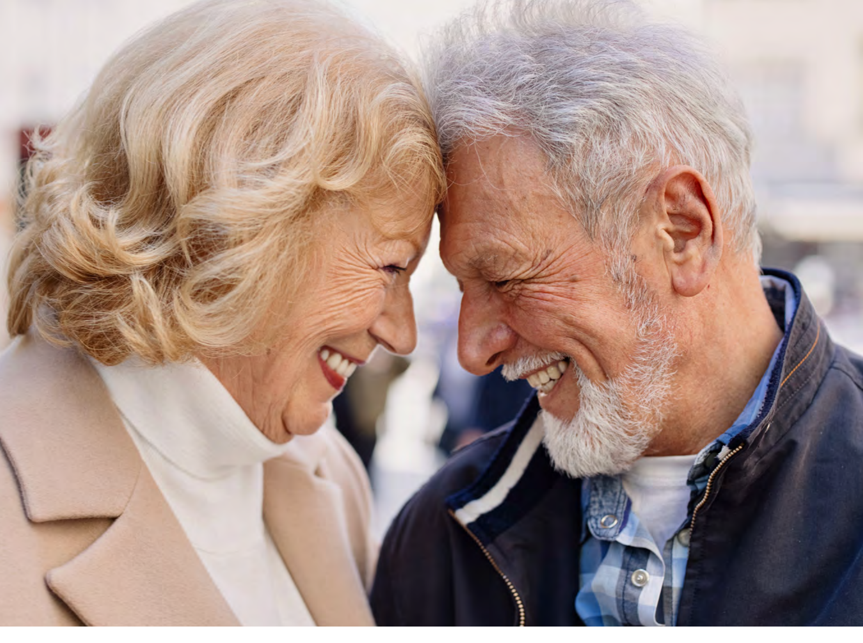
2 | AmeriHealth Caritas VIP Care